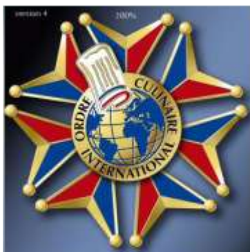
Medal ceremony diameter 5.5 cm with clip hangs jacket